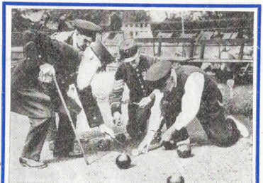
£30,850. ROYAL ALFRED AGED SEAMEN'S INSTITUTION —provides homes for aged seamen, pensions, Samaritan and Widows Funds, and deals with all cases of Merchant seamen and their dependents arising out of the war.