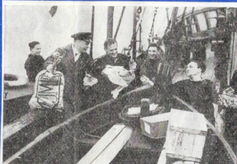
£12,760. MISSIONS TO SEAMEN —provides hostels and clubs at home and overseas, and carries out welfare and missionary work for seamen.