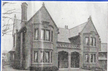
£31,300. MERCANTILE MARINE SERVICE ASSOCIATION —£20,000 provided for 20 cottage homes for aged Merchant Navy Officers and their wives at Wallasey and £11,300 for free homes and funds for aged or incapacitated seamen and their dependents.