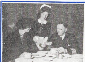
£25,000. THE OCEAN CLUB —purchased in 1945 by K.G.F.S. and presented to the Liverpool Seamen's Welfare Centre as a memorial to the Officers and Men who sailed from Liverpool in the war.