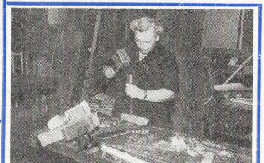
£5,000. WOMEN'S ROYAL NAVAL BENEVOLENT TRUST —helps all W.R.N.S. and ex W.R.N.S. who may at any time need assistance. Also provides training grants on demobilization.

FROM THE CENTRAL FUND KING GEORGE'S FUND FOR SAILORS