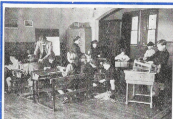
£6,490. THE ROYAL MERCHANT NAVY SCHOOL, BEARWOOD —educates the children and orphans of Merchant seamen. K.G.F.S. grant is towards maintenance.